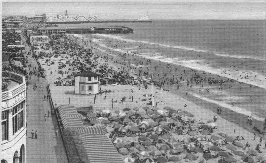
SM-32 LOOKING TOWARDS OCEAN PARK FROM BEACH CLUBS, SANTA MONICA, CALIFORNIA