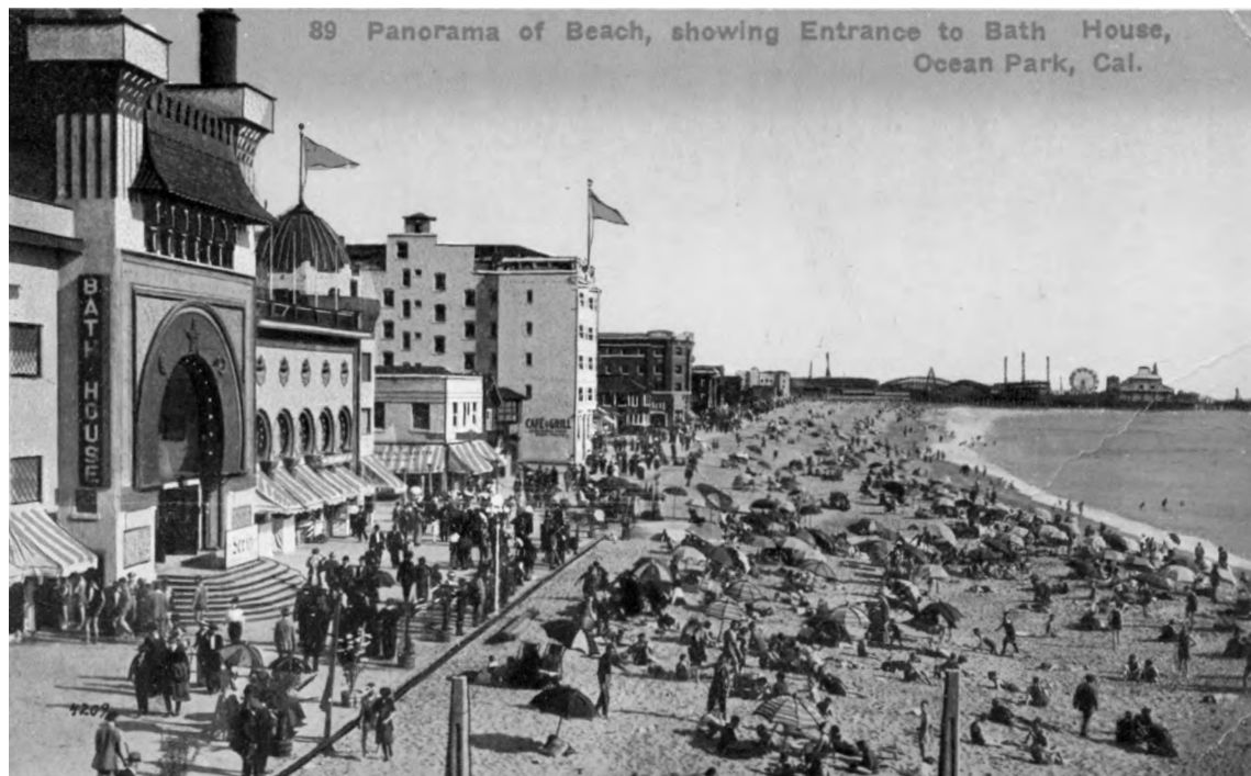
89 Panorama of Beach, showing Entrance to Bath House, Ocean Park, Cal.