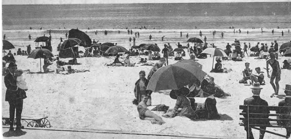
Bathing every day in the year at Ocean Park, California.