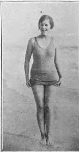
MISS IMOGENE INGALLS, Popular actress from San Fran- cisco, whose main recreation is periodic visits to the beach at Palisades Del Rey.