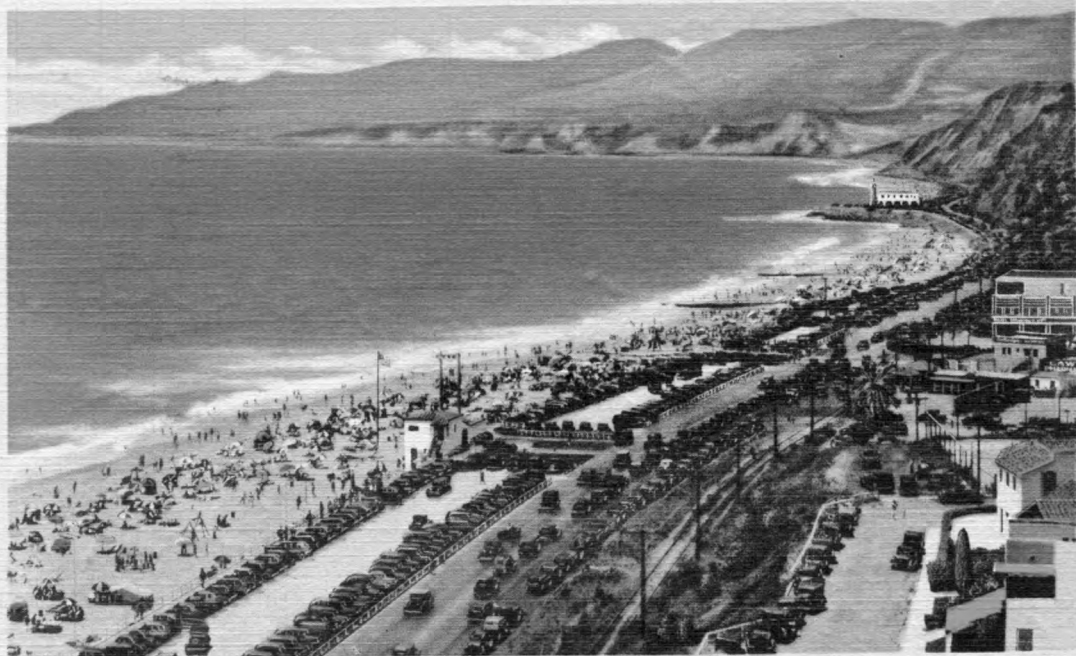
SM-33 LOS ANGELES COUNTY BEACH, SANTA MONICA, CALIFORNIA